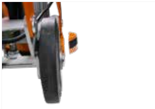
Grinding and Polishing close to the wall