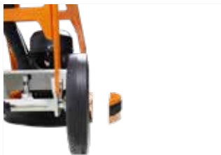
Grinding and Polishing close to the wall