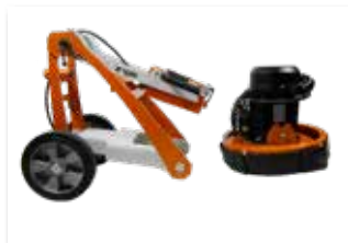
Foldable frame & dividable parts