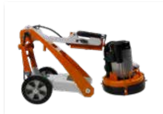
Foldable frame & dividable parts